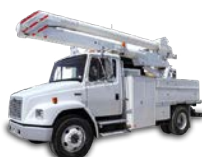
SERVICE & UTILITY